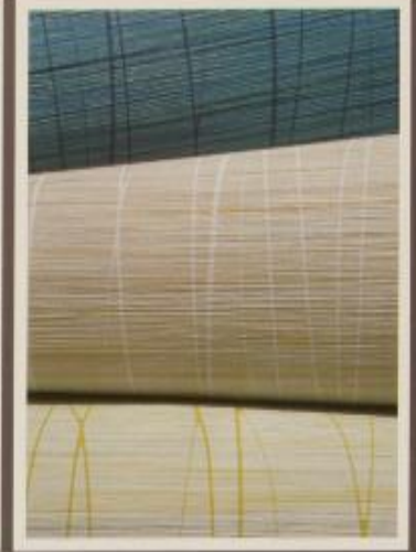
15 OZ COLLECTION